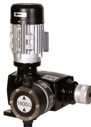
EFR DOSING PUMP