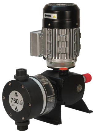
DOSTEC 50 DOSING PUMP